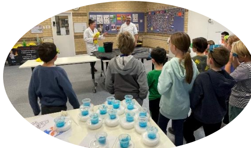
FriYAY Youth Club

Air Brush Venturi Art Buzz Auslan Factory Art Therapy Connect Best Beginnings Playgroup (DCP) Child and Adolescent Health Service Super Mandarin First Step Solutions LitCity Church