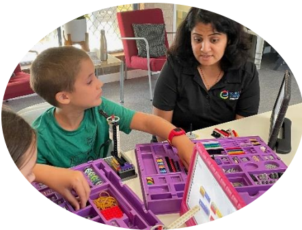
E2 Young Engineering