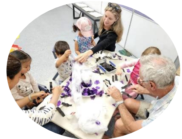
Nyat Djena Playgroup