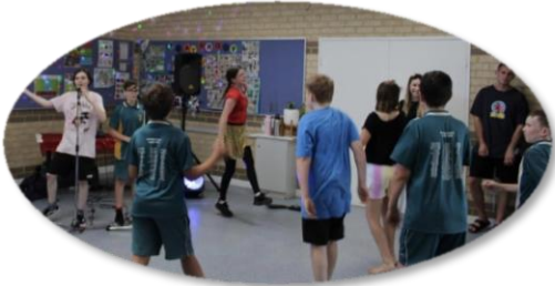
All Stars For Autism

Below are some of our regular programs which benefited our local community in 2023: