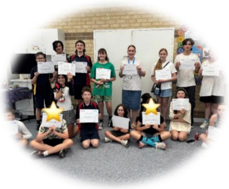
All Stars for Autism

Below are some of our regular programs which benefited our local community in 2024: