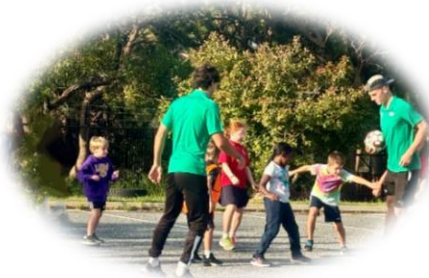
FriYAY Youth Club

Air Brush Venturi Art Buzz Tippy Toez Art Therapy Connect Best Beginnings Playgroup (DCP) Child and Adolescent Health Service Buddhist Meditation Society Chantelle Milner Yoga LitCity Church